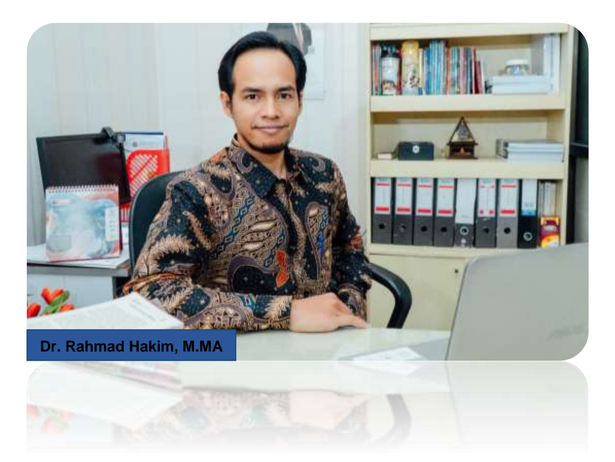
Prospectus of Islamic Economics Department 2023 4

Graduate profiles from this program include becoming managers in bank and non-bank Islamic financial institutions, researchers, financial statement service providers and entrepreneurs/entrepreneurs in accordance with Islamic business ethics.